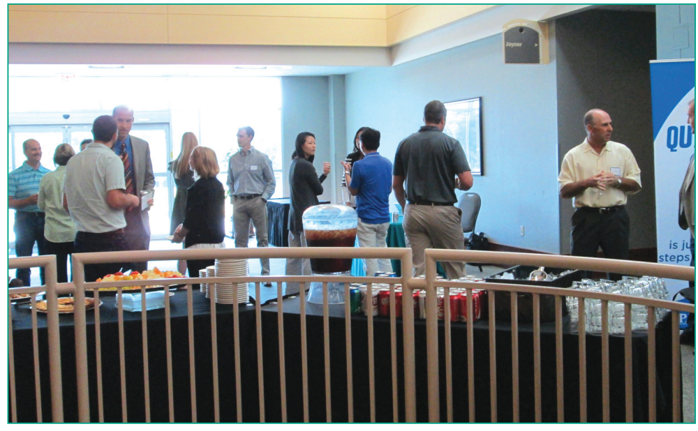
Seminar attendees visit with each other during a break in the day. We thank everyone who attended and hope to see you next year!